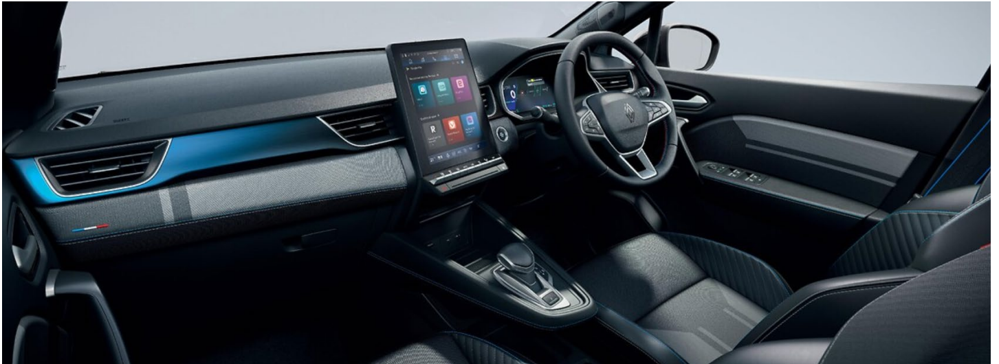
techno esprit Alpine and iconic esprit Alpine