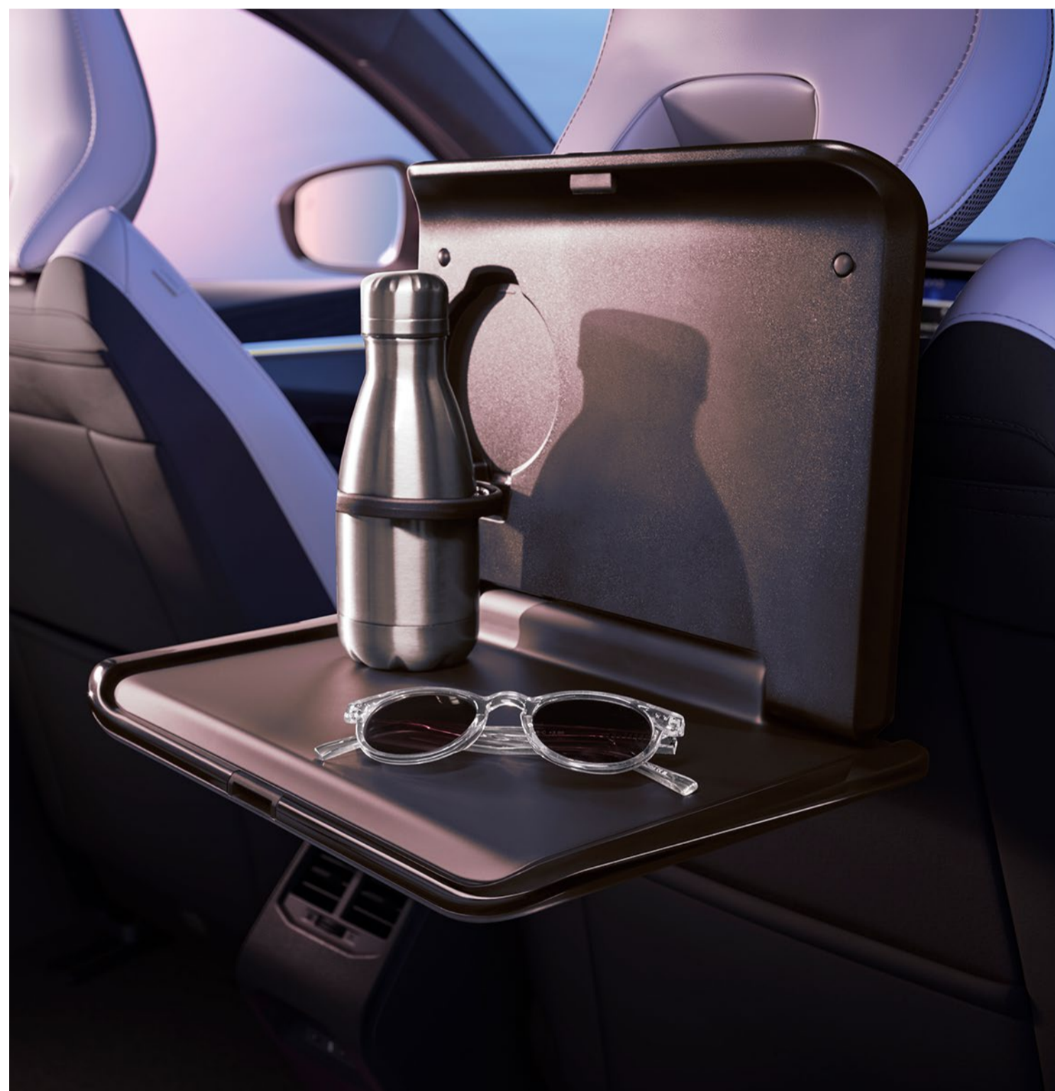
rear tray table 7711785947

storage pack + available with 2 tray tables & 2 fixings