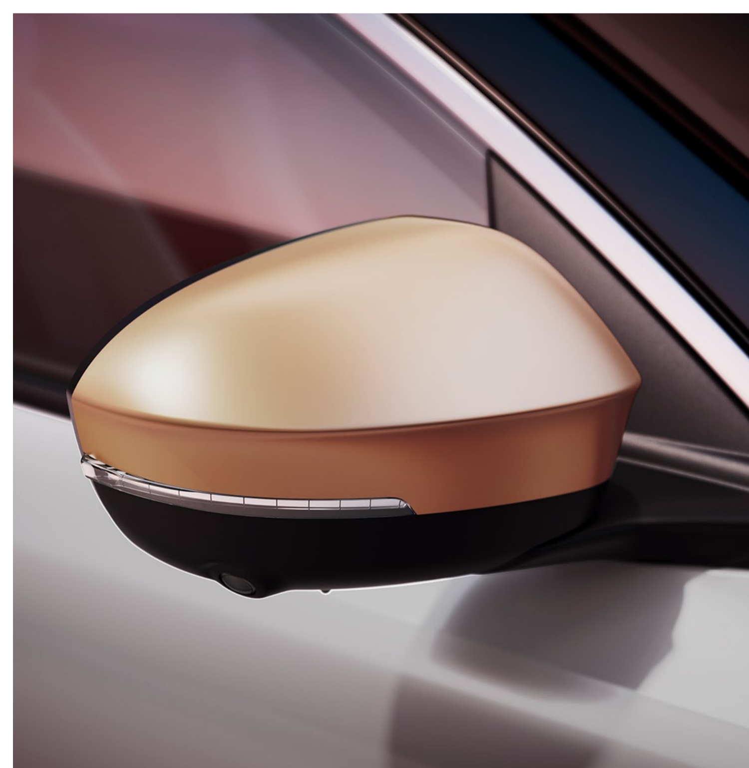
gold accents 963H13973R