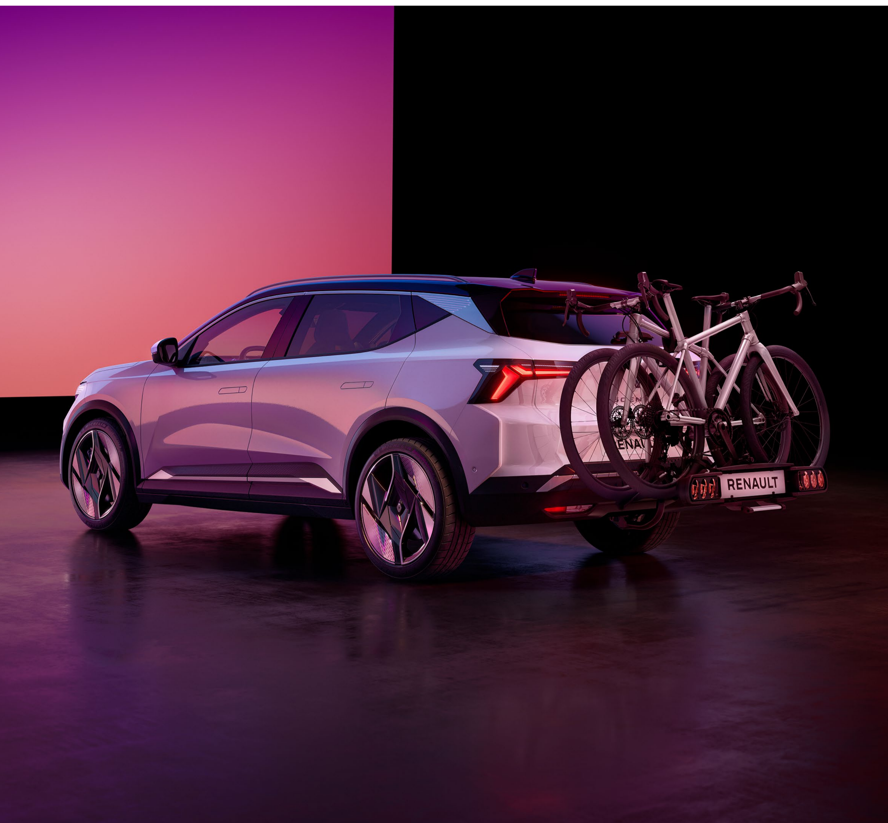
tool-free removable towbar pack and 2-bike rack on towbar

Equipped with a towbar, Renault Scenic E-Tech electric can tow up to 1.1 t and easily transport a bike rack (75 kg of vertical load).