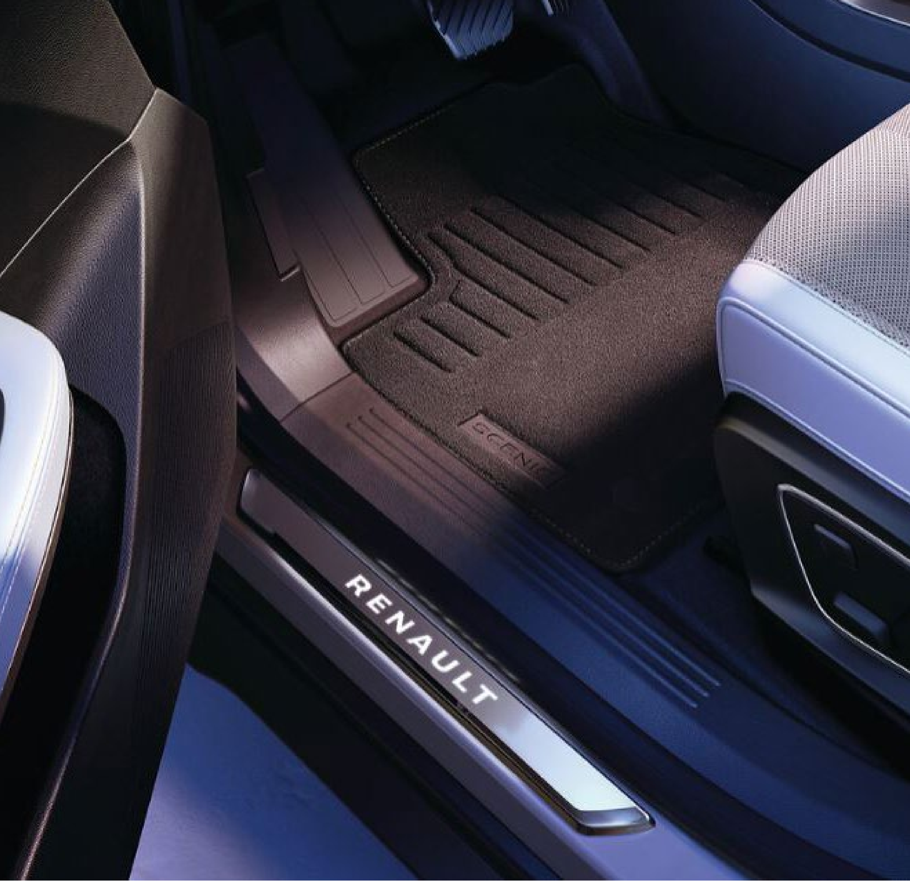
illuminated door sills 8201731140