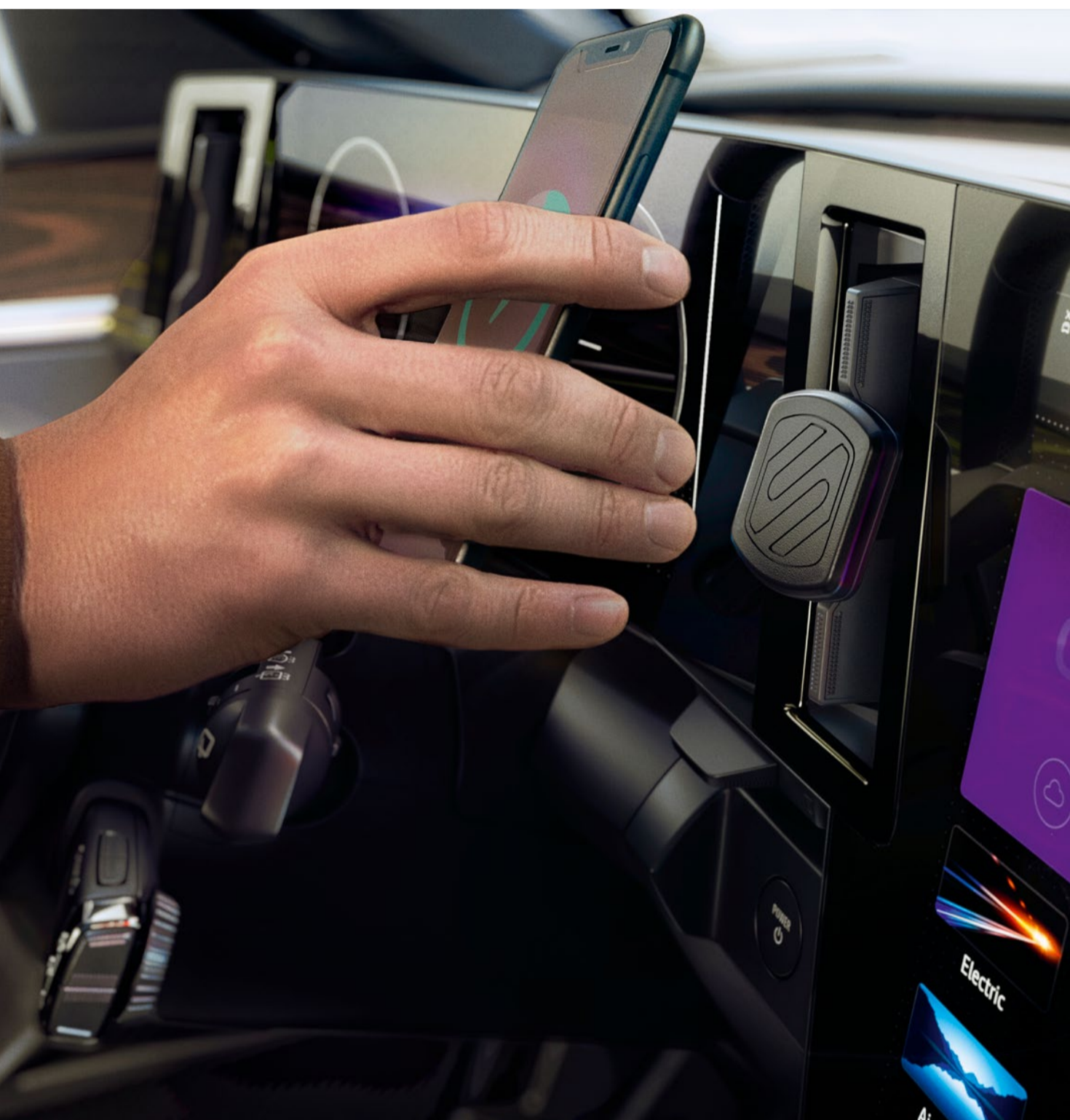
magnetic vent-mounted smartphone holder 7711784774