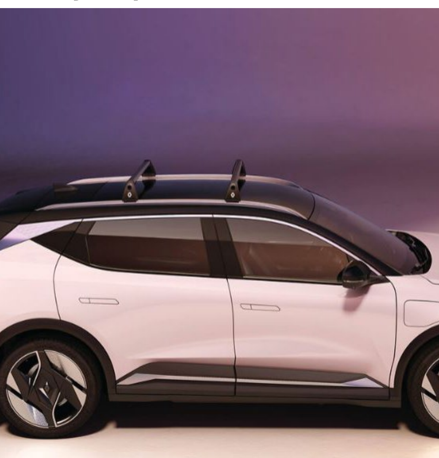
quick fix longitudinal roof bars 738207220R