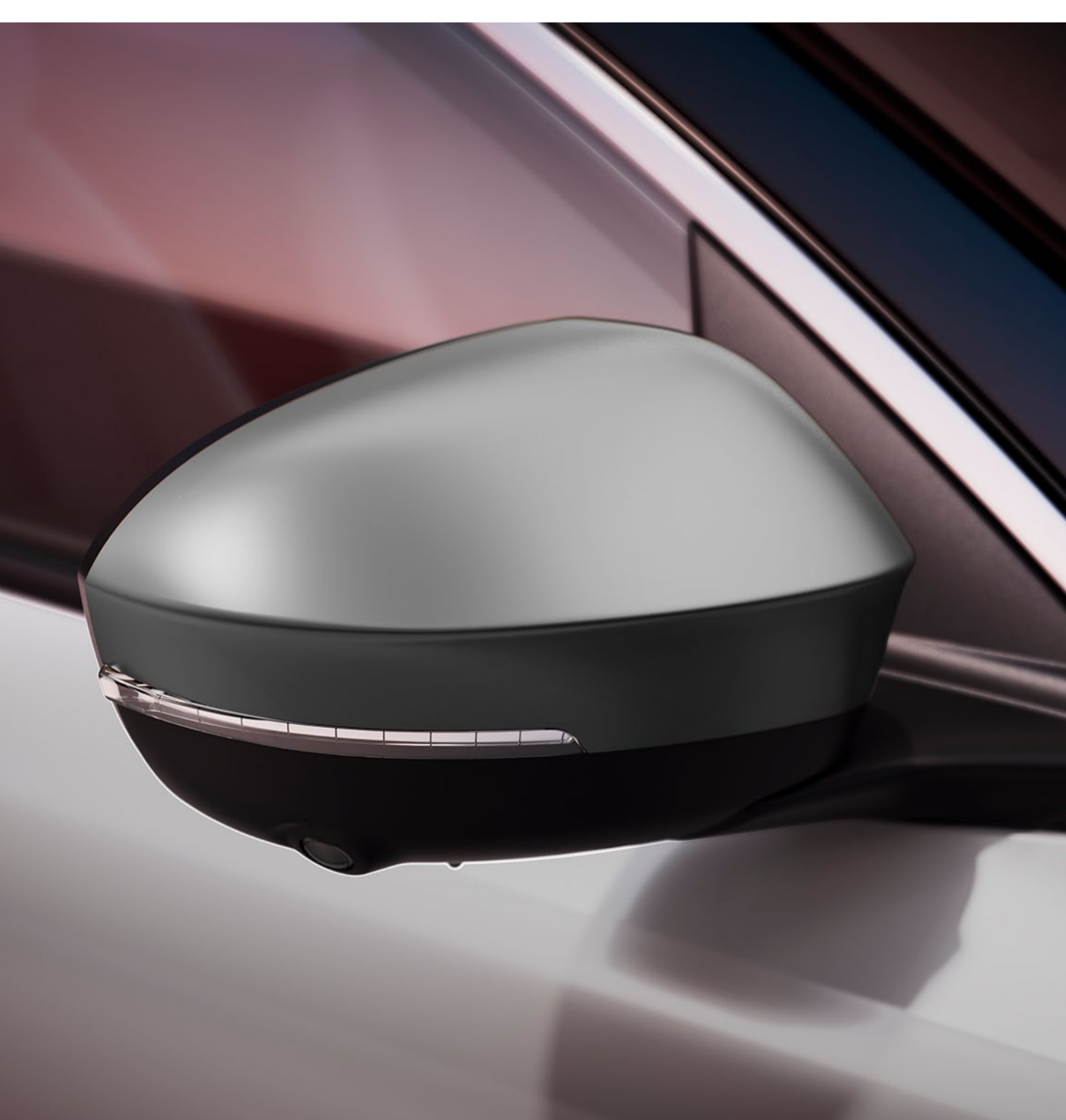
satin metal grey 963H12719R