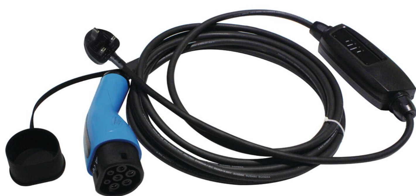
domestic charging cable 7711943866