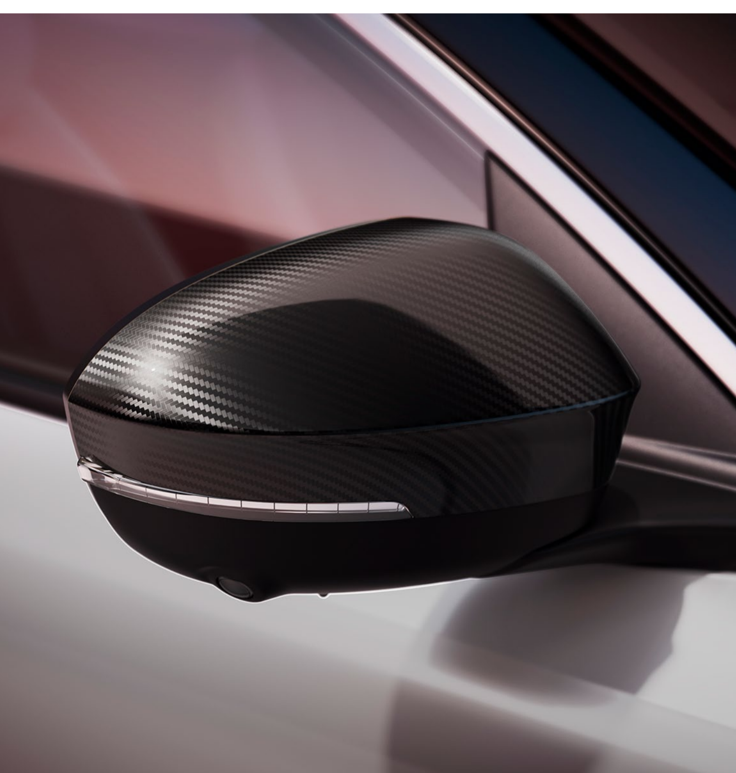
carbon effect 963H11462R