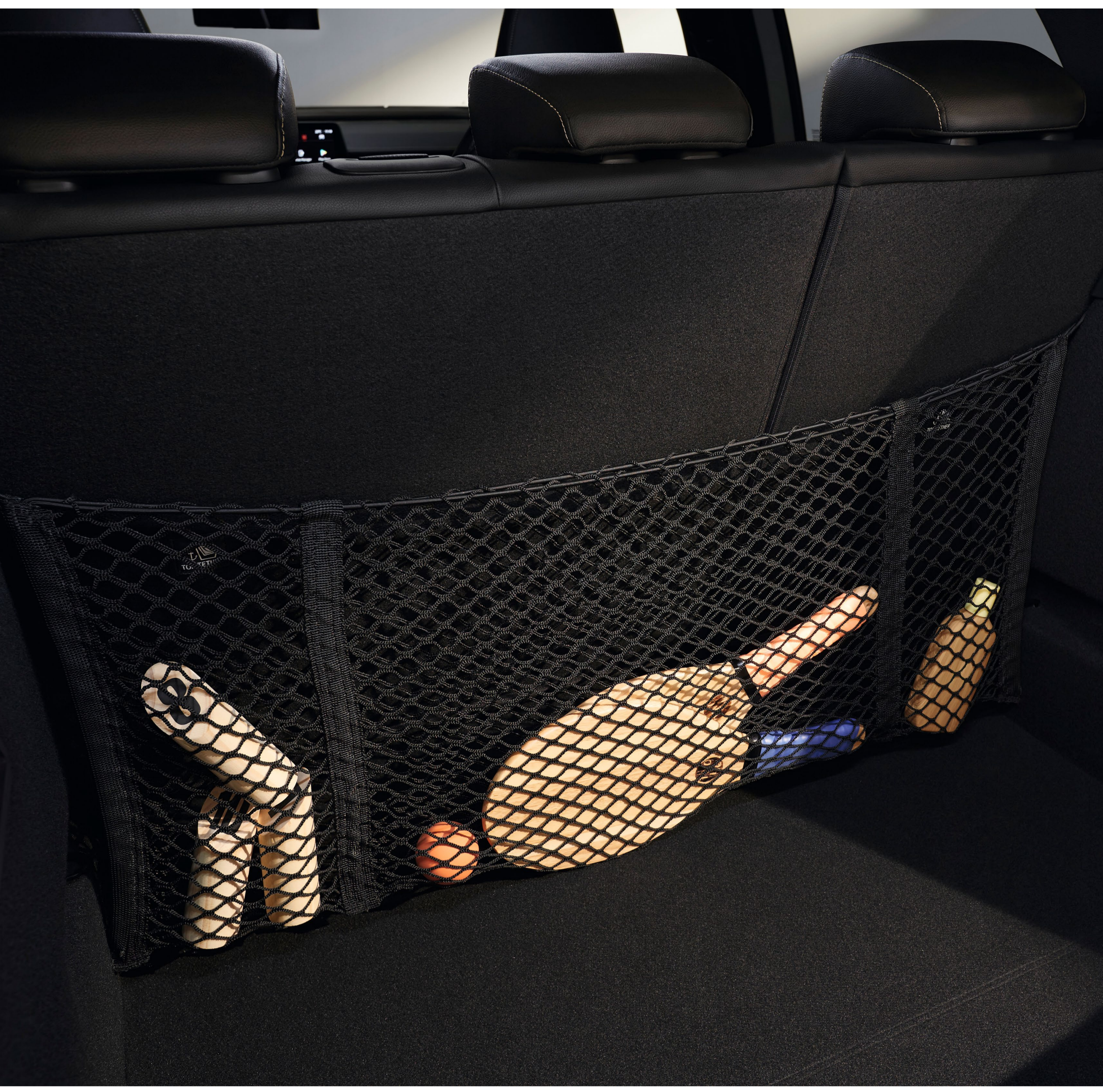
vertical boot storage net 7711227502