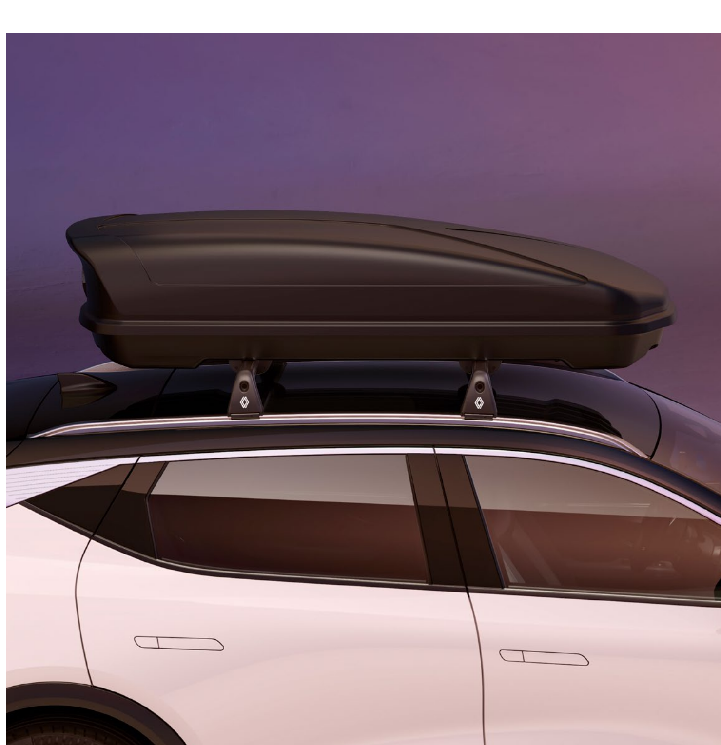
roof box 480L 7711948972