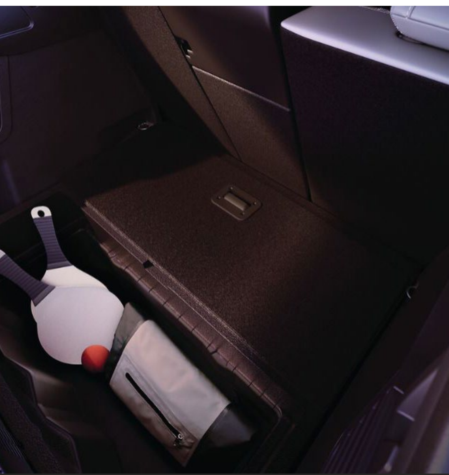
double floor for cable storage 849P35338R