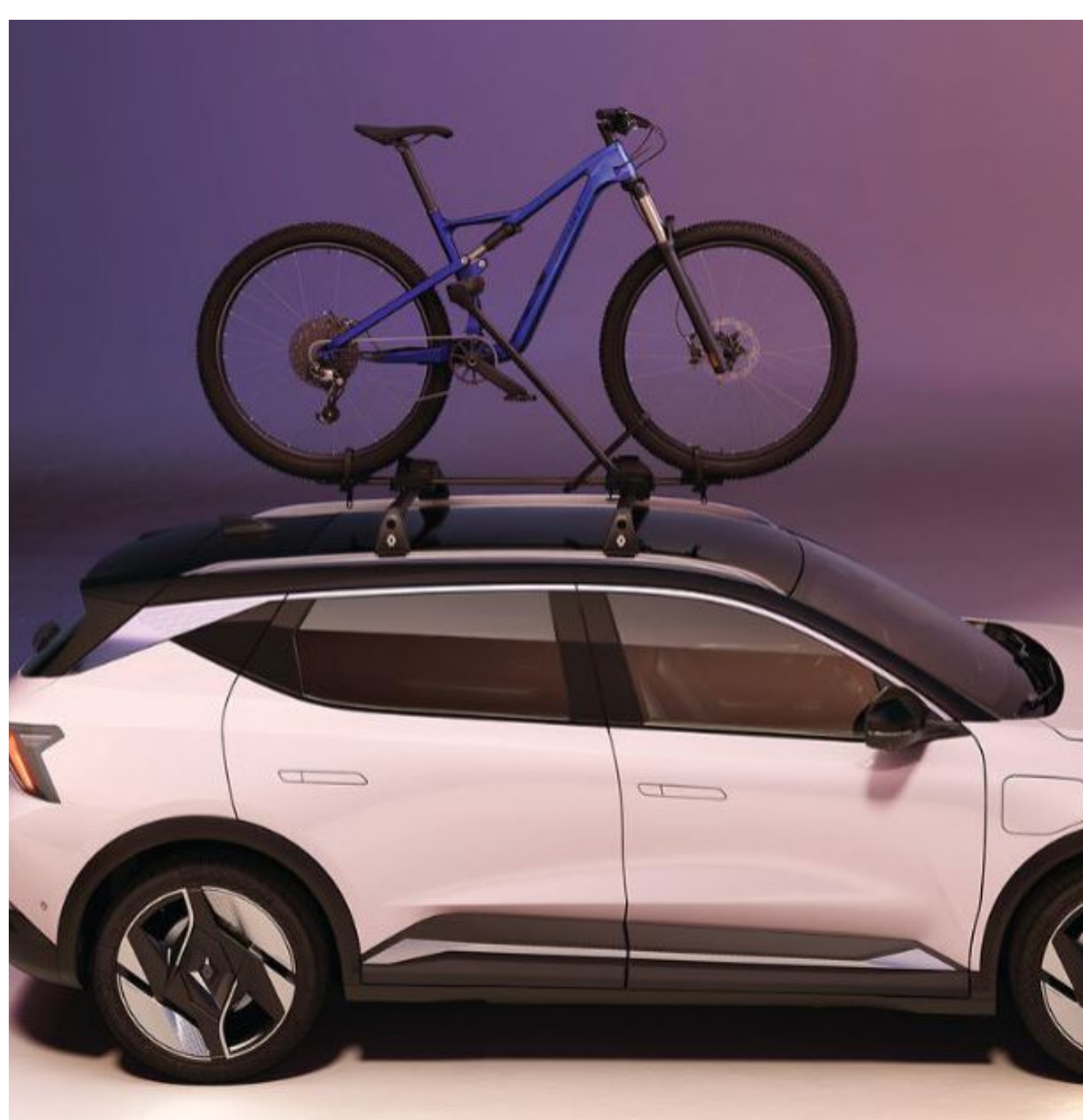
roof mounted bicycle carrier 7711949992 x 2