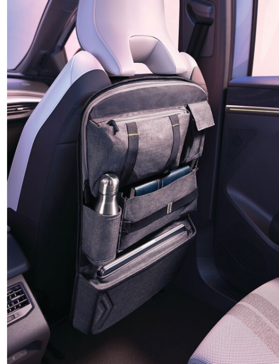
seat organizer 7711948825

The Renault mudguards protect the underbody and wheels from water, mud splatter and flying gravel.