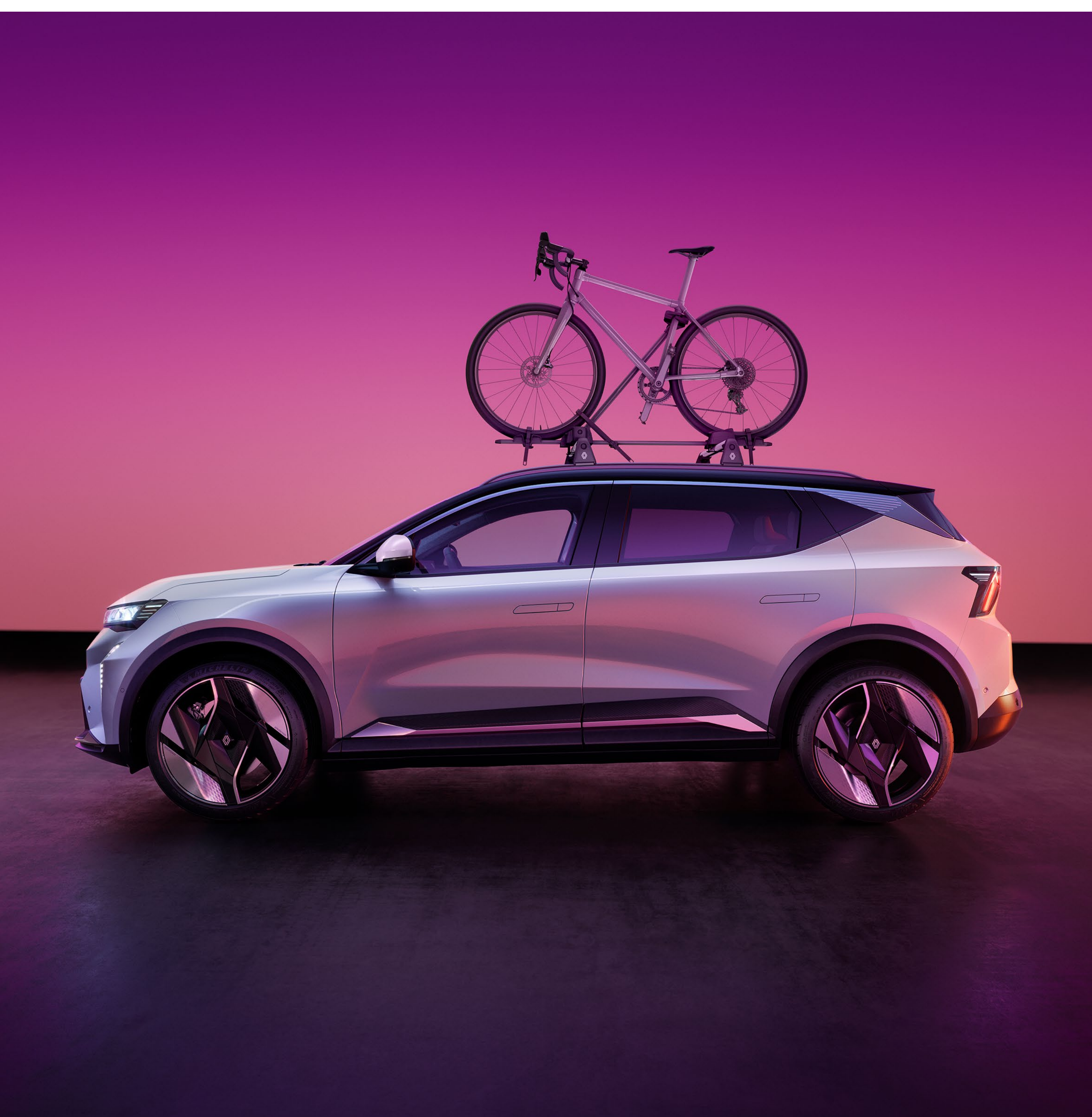
roof bars and roof mounted bike rack

Choose from our range of touring accessories, bicycle racks and towbars.