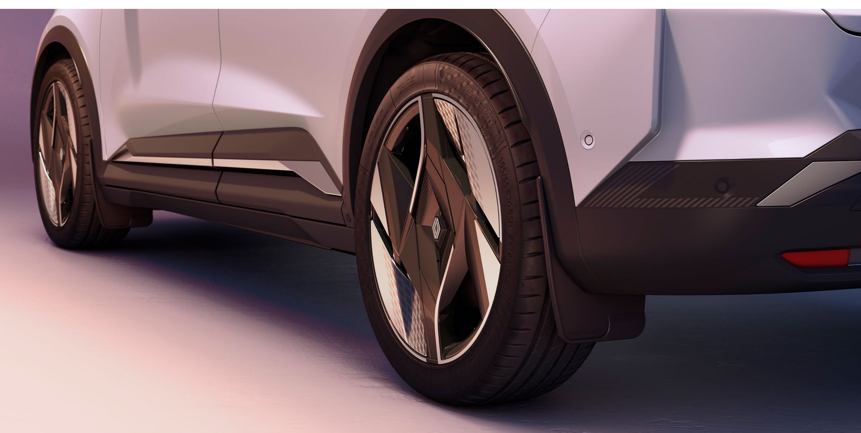
front and rear mud guards 2 x 7717274244