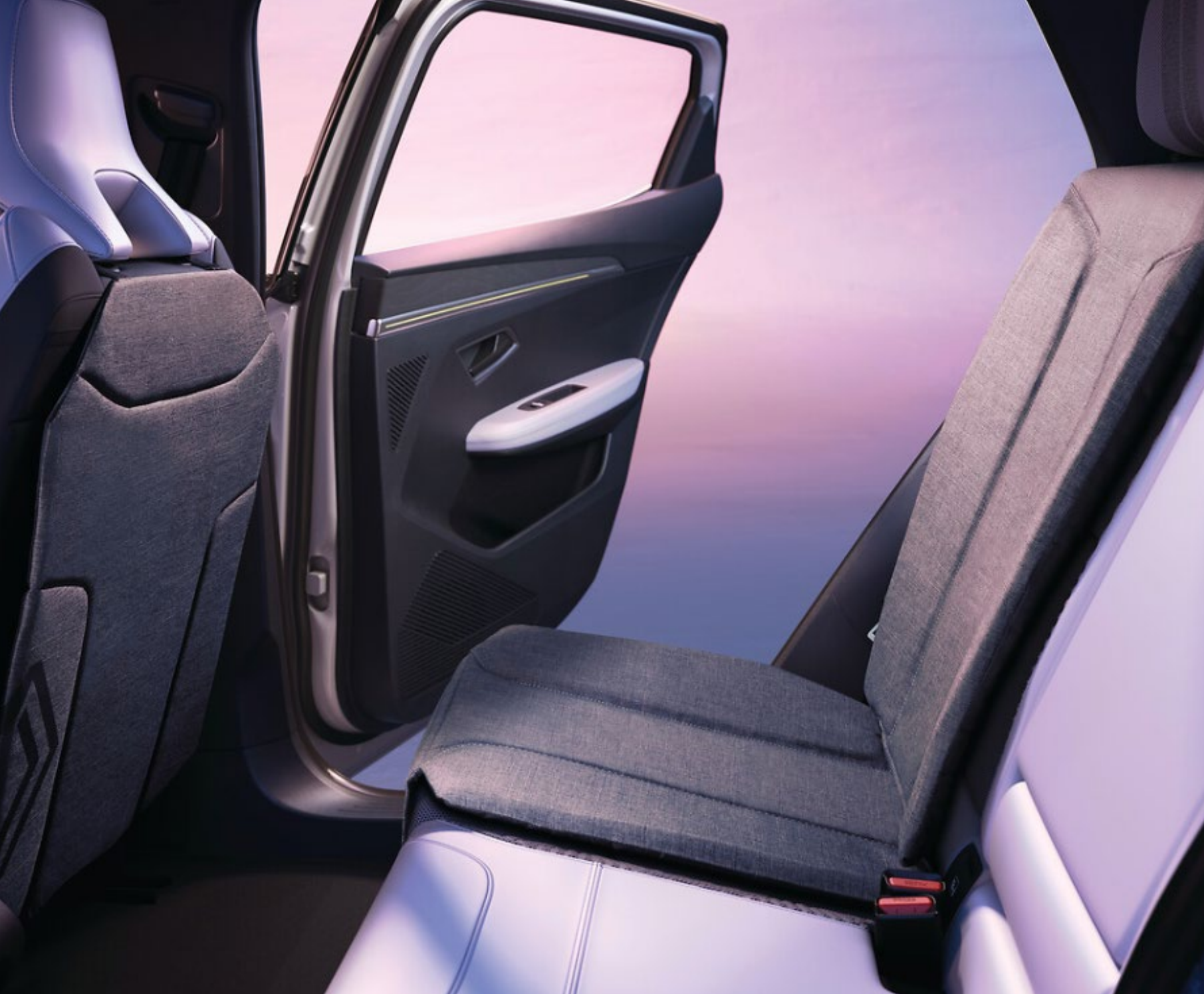
child seat protector + kick mat 7717300448