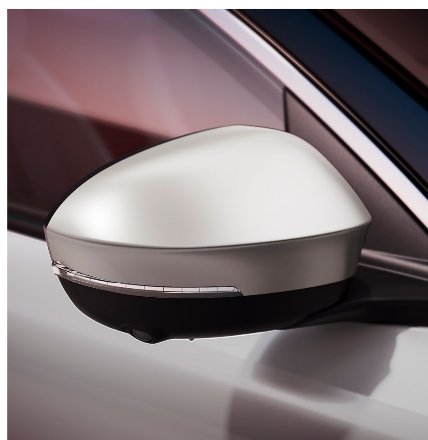
light grey 963H18815R