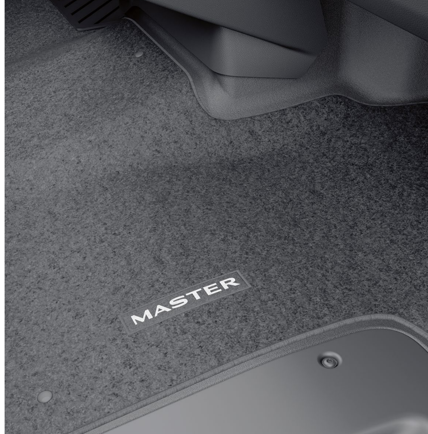
fabric floor mat

Seat covers that protect the original upholstery from wear and dirt. Removable smartphone holder that allows you to use your phone fully and safely during your journeys. Finally, the cool box to keep meals and drinks at the right temperature.