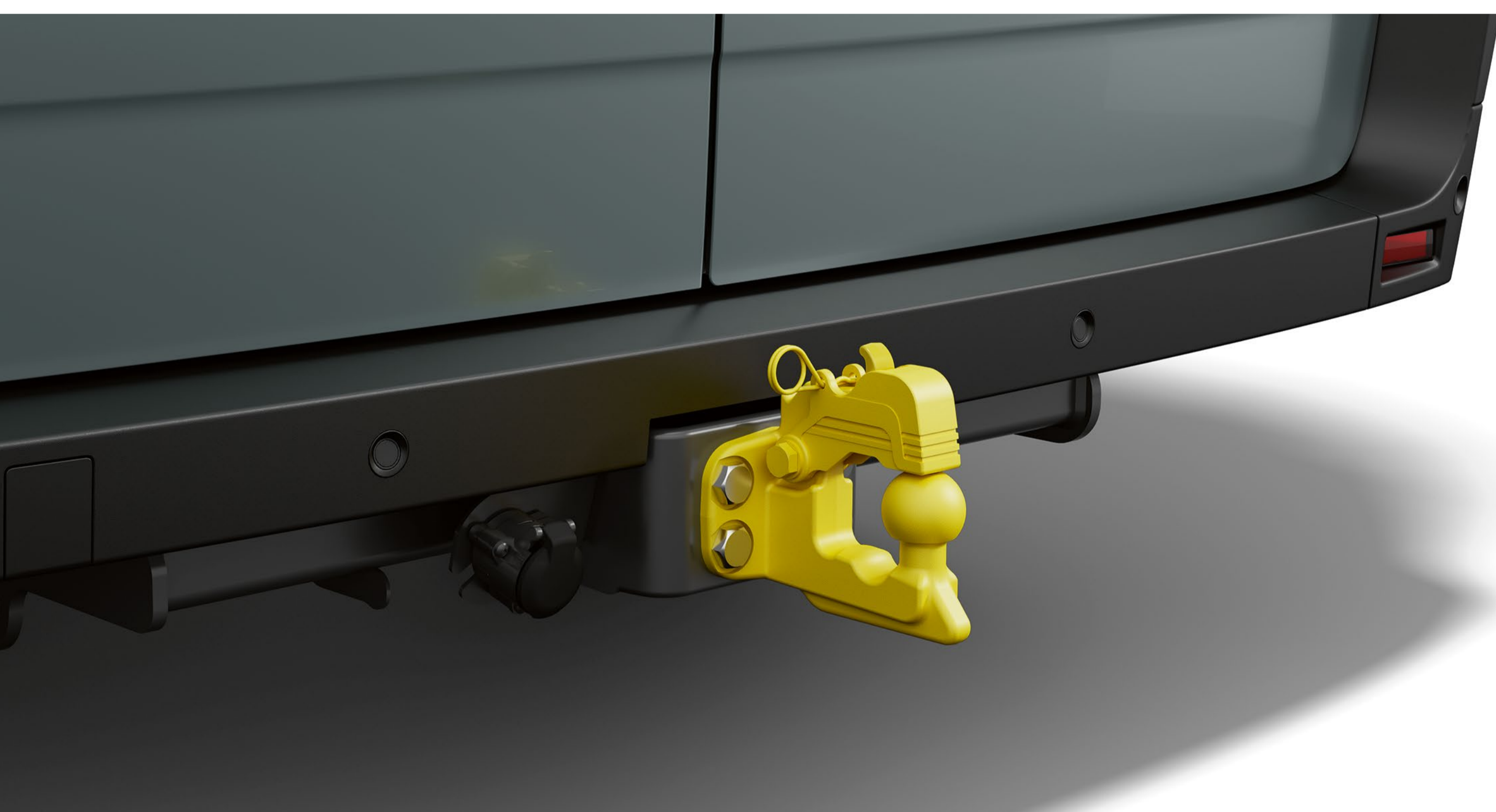
standard coupling and 4-hole mixed hook

The standard towbar pack with ball joint or the 4-hole mixed hook are solutions for towing your loads that meet the best safety standards.