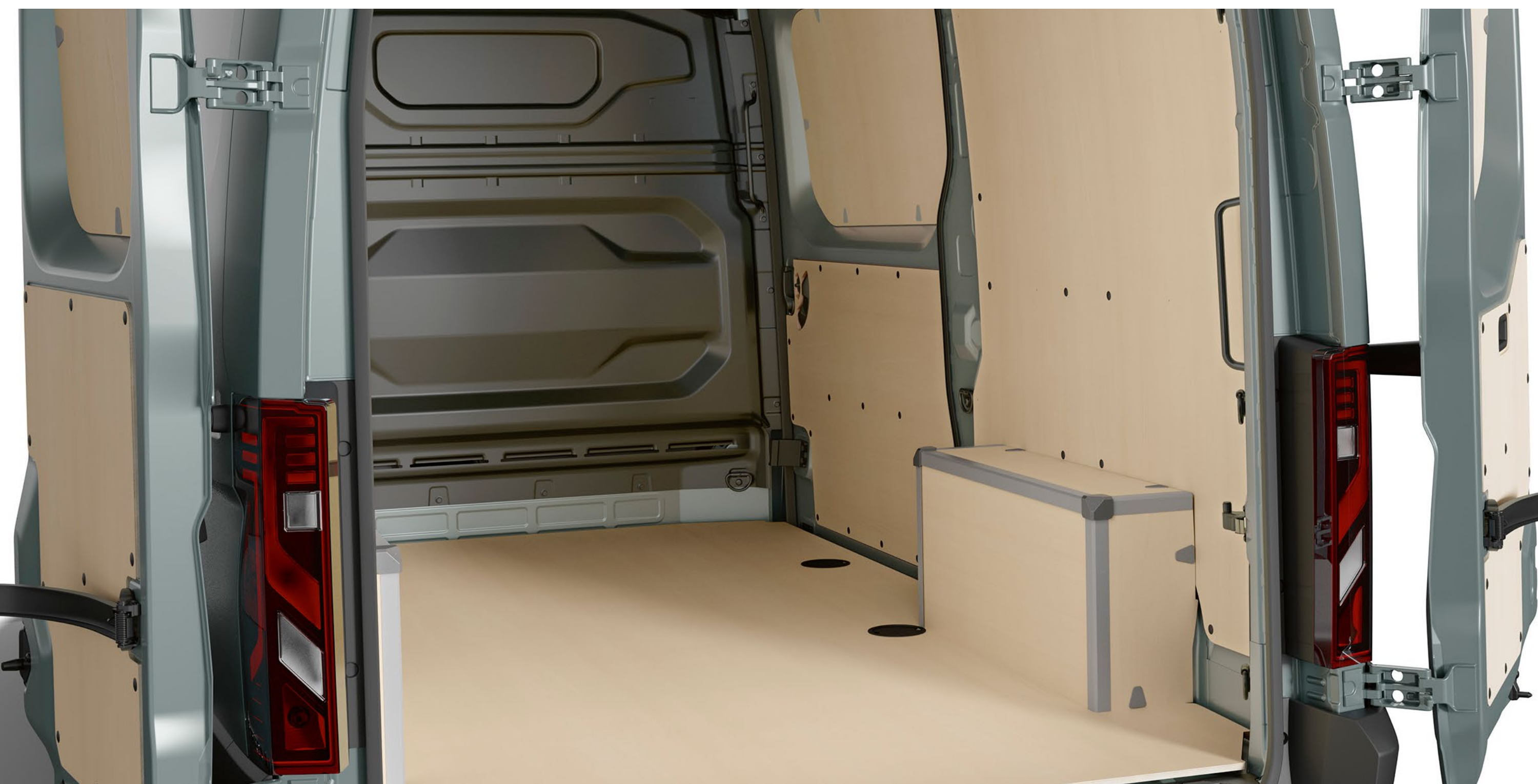
standard poplar wood trim

Standard wood finish: the quality of poplar wood for sturdy trim with a 12 mm wooden floor. Especially suitable for standard use in a dry environment.