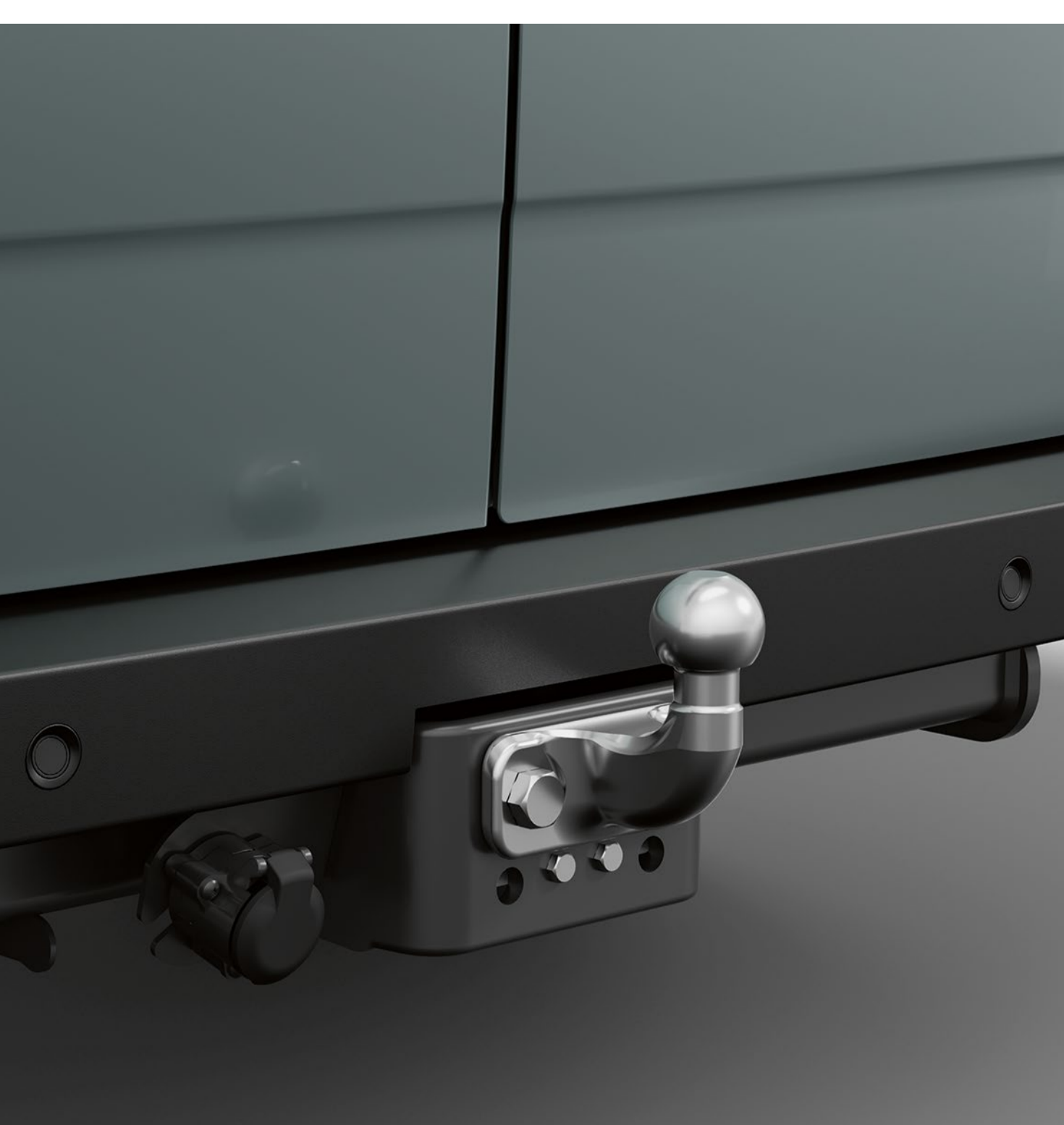
standard towbar with ball joint

Fitted with a ball joint or drawbar, Renault towbar packs are 100% compatible with Renault Master and there is no risk of their being distorted. For maximum flexibility, opt for the towbar with drawbar pack. You can then tow a ring or ball-joint trailer.