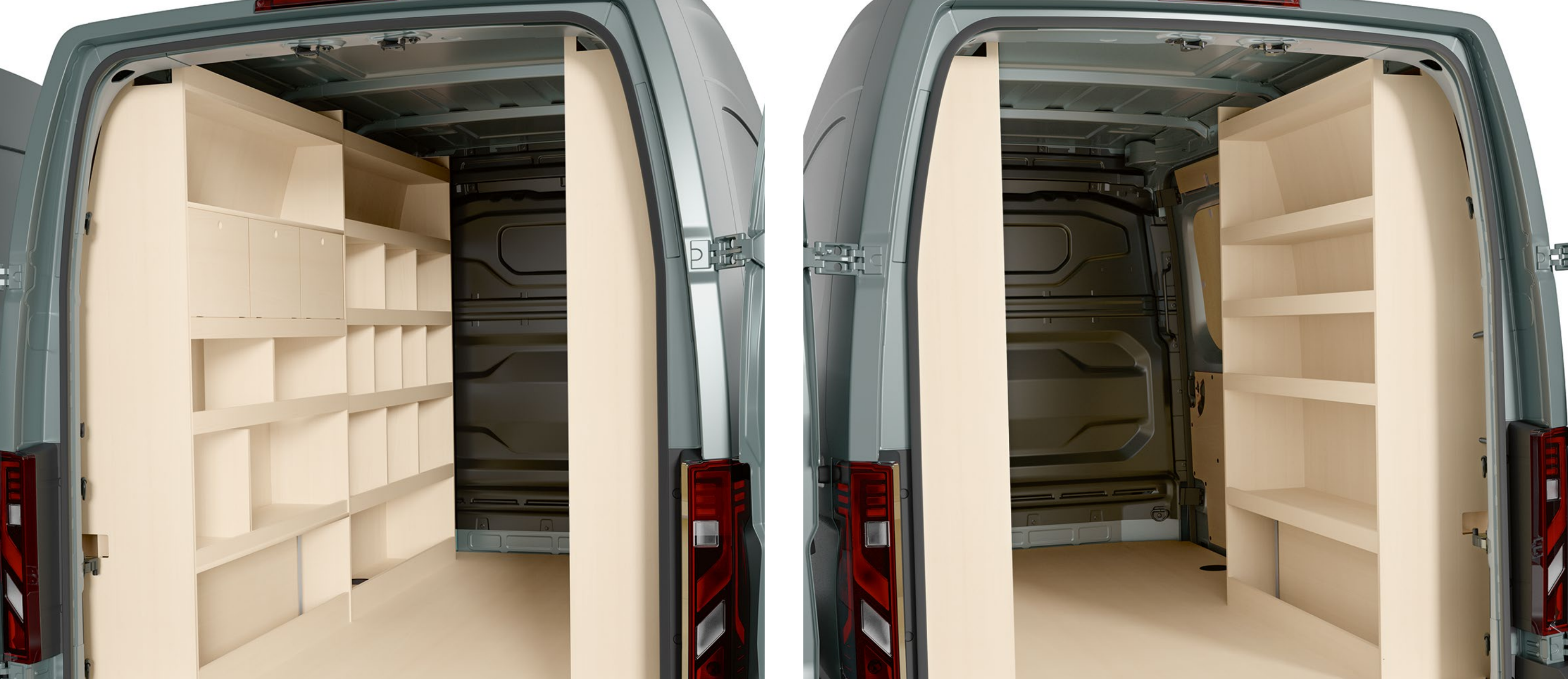
front and left rear lockers, with shelves, open compartments and closable hatches

Customise your loading area with linear shelves and open or closed lockers. Practical and straightforward to install, they will keep your equipment tidy and within easy reach.