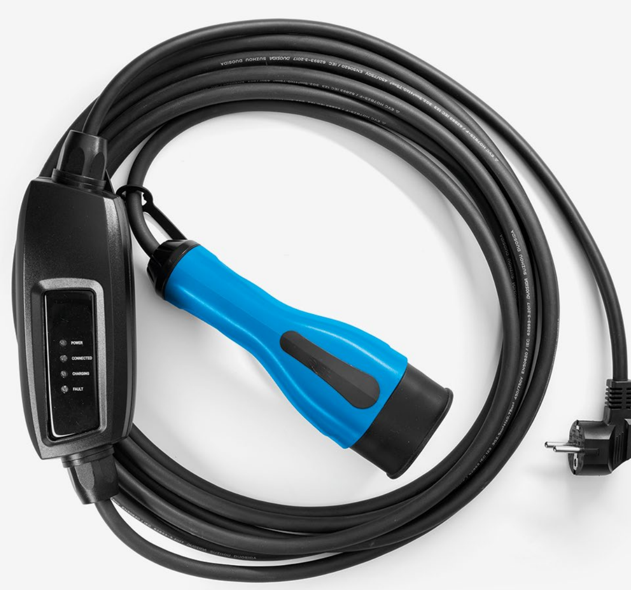
reinforced domestic cable