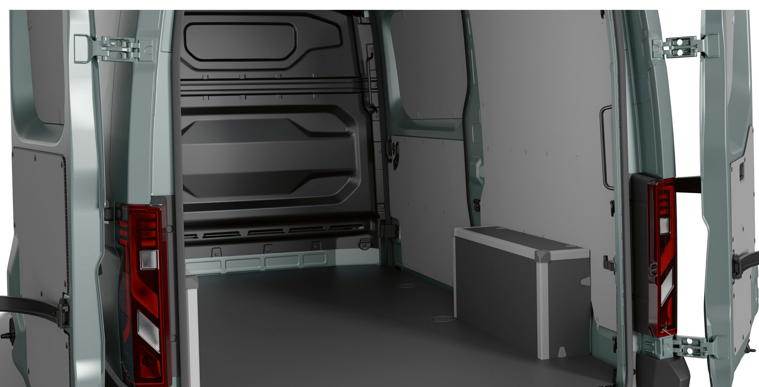
innovation polypropylene trim

Innovative finish: washable, moisture-resistant and up to 65% lighter than wood. Ideal for maximising the range of an electric vehicle.