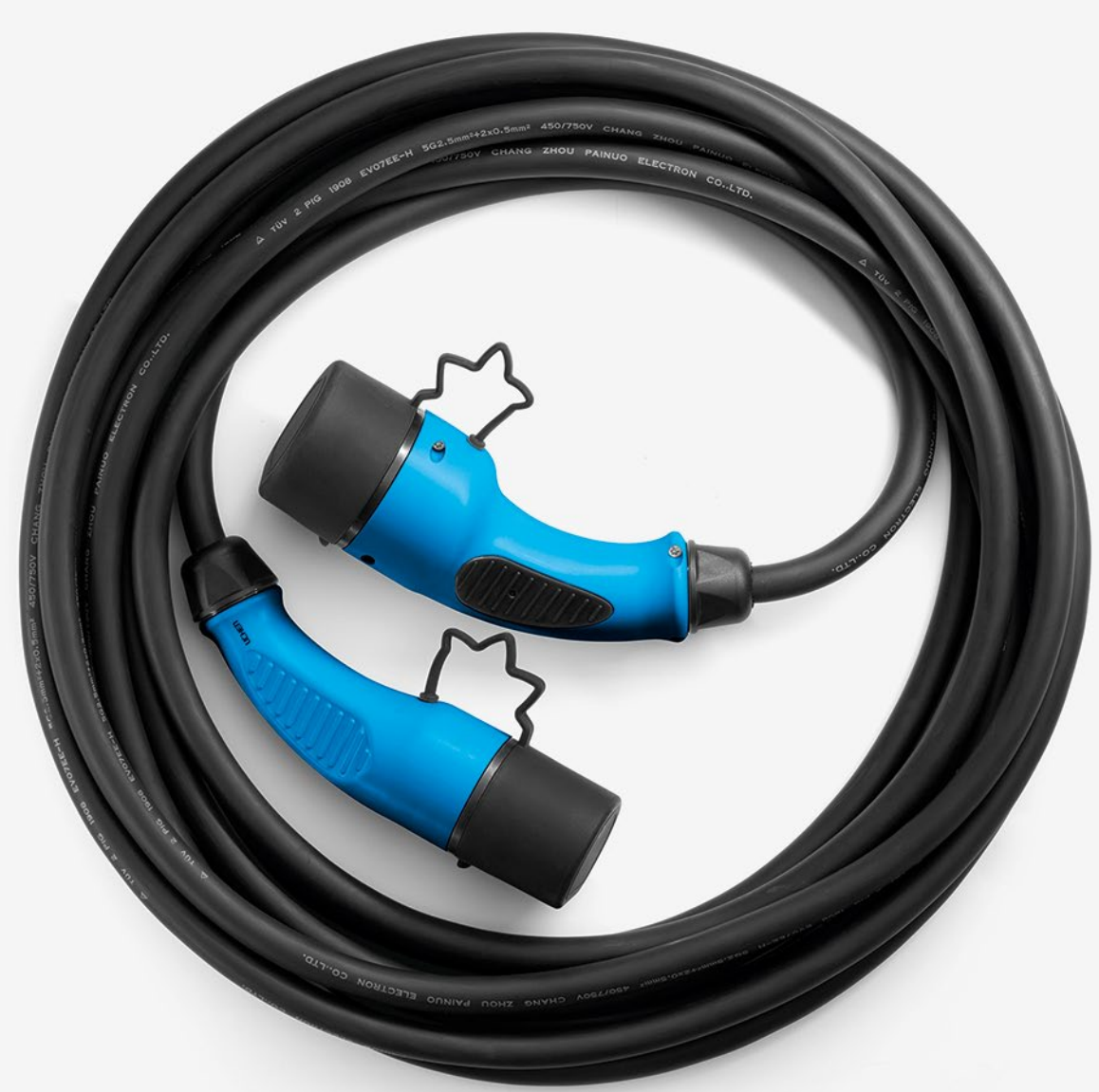
type 2 cable for wallbox

Take advantage of the flexicharger cable that can be used with a reinforced domestic socket (3 h 55 for 50 km), and/or occasionally the domestic cable adapted for use with standard sockets (6 h 28 for 50 km). The type 2 charging cable, for long journeys, is used with public and domestic charging stations.