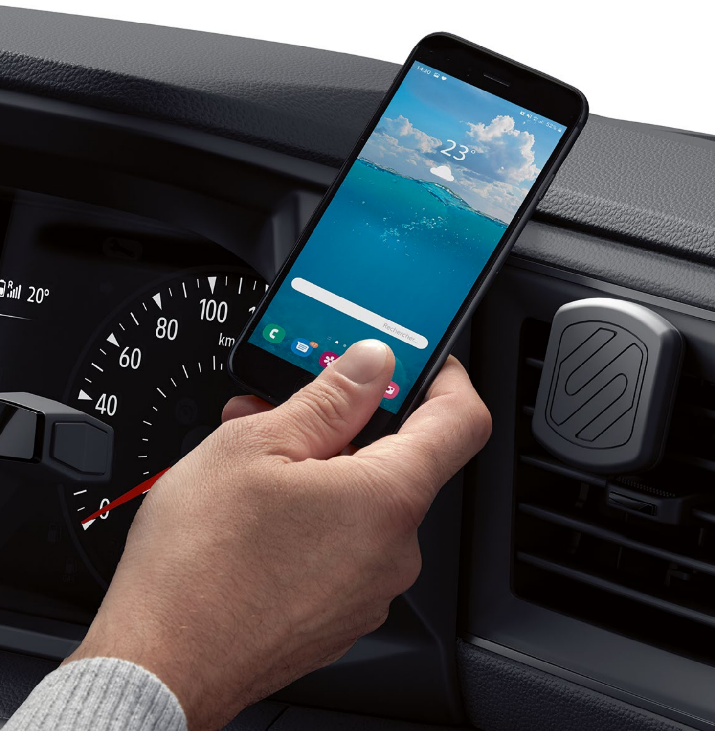
magnetic smartphone holder