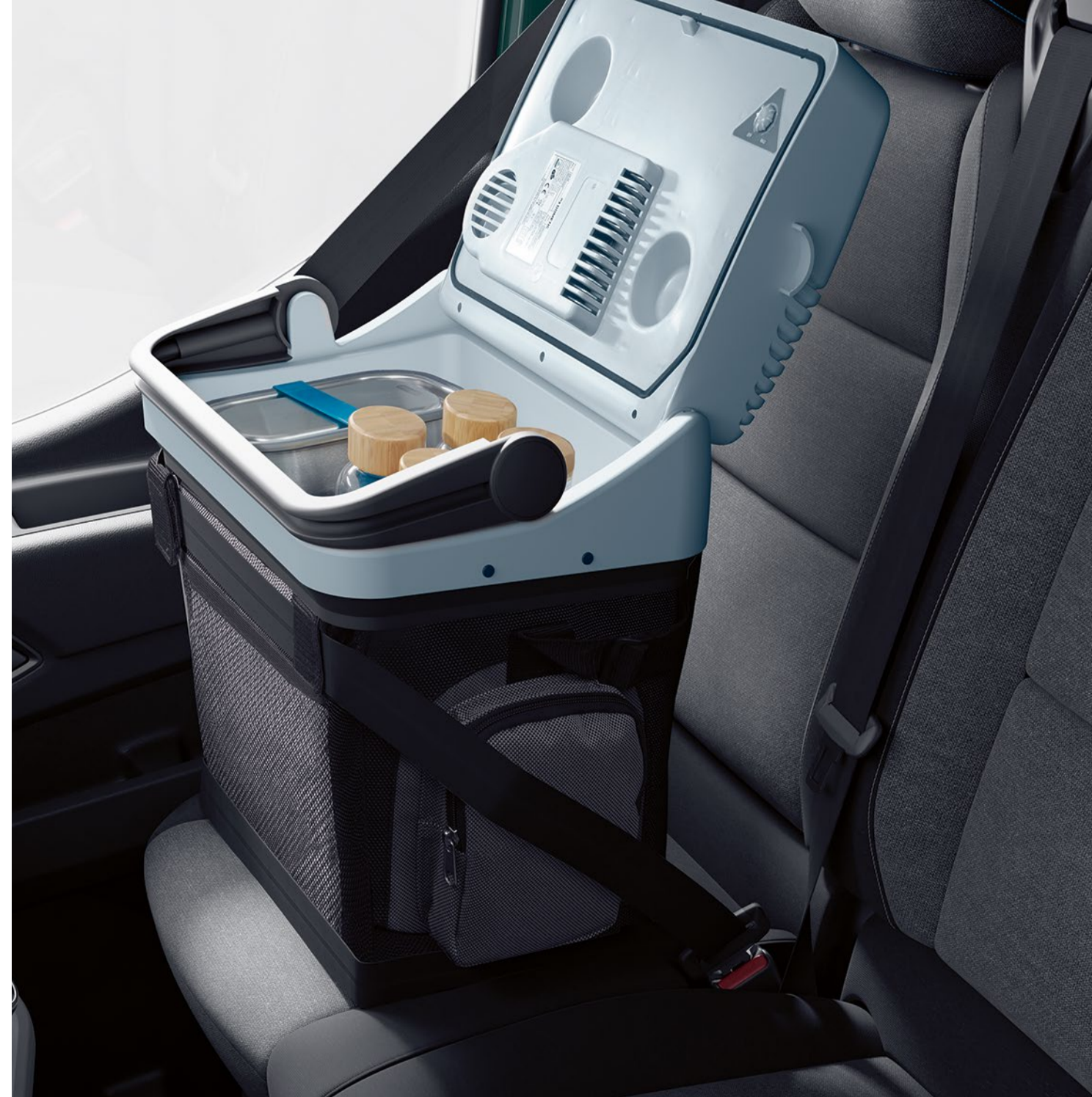
12 V-220 V cool box