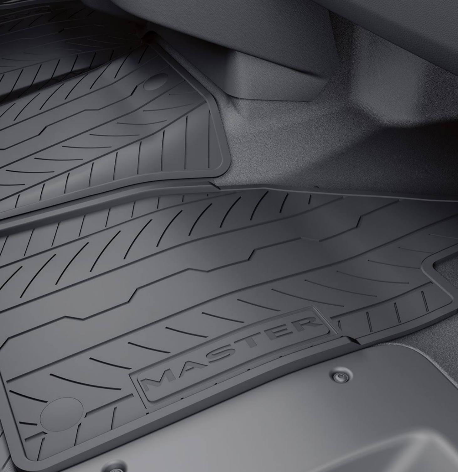
rubber floor mats

Attached with safety clips, resistant to dirt and easy to maintain, the floor mats provide you with protection and comfort. They are available in rubber or fabric and are made to measure.