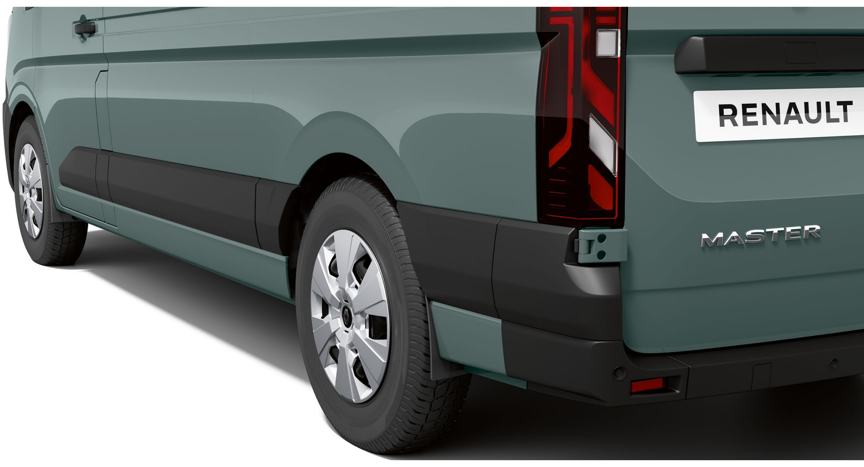
front and rear mudguards

By installing mud flaps and/or wheel arch protections, prevent gravel and mud causing damage to your vehicle's underbody.