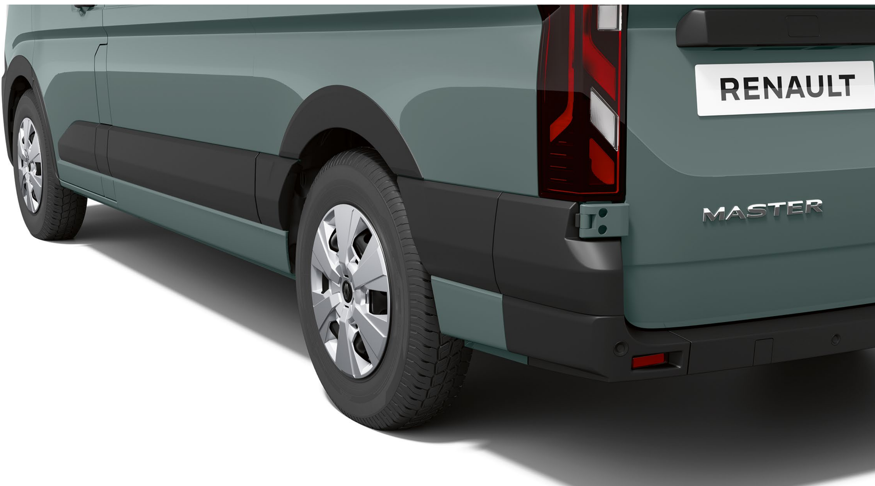
front and rear wheel arch protections