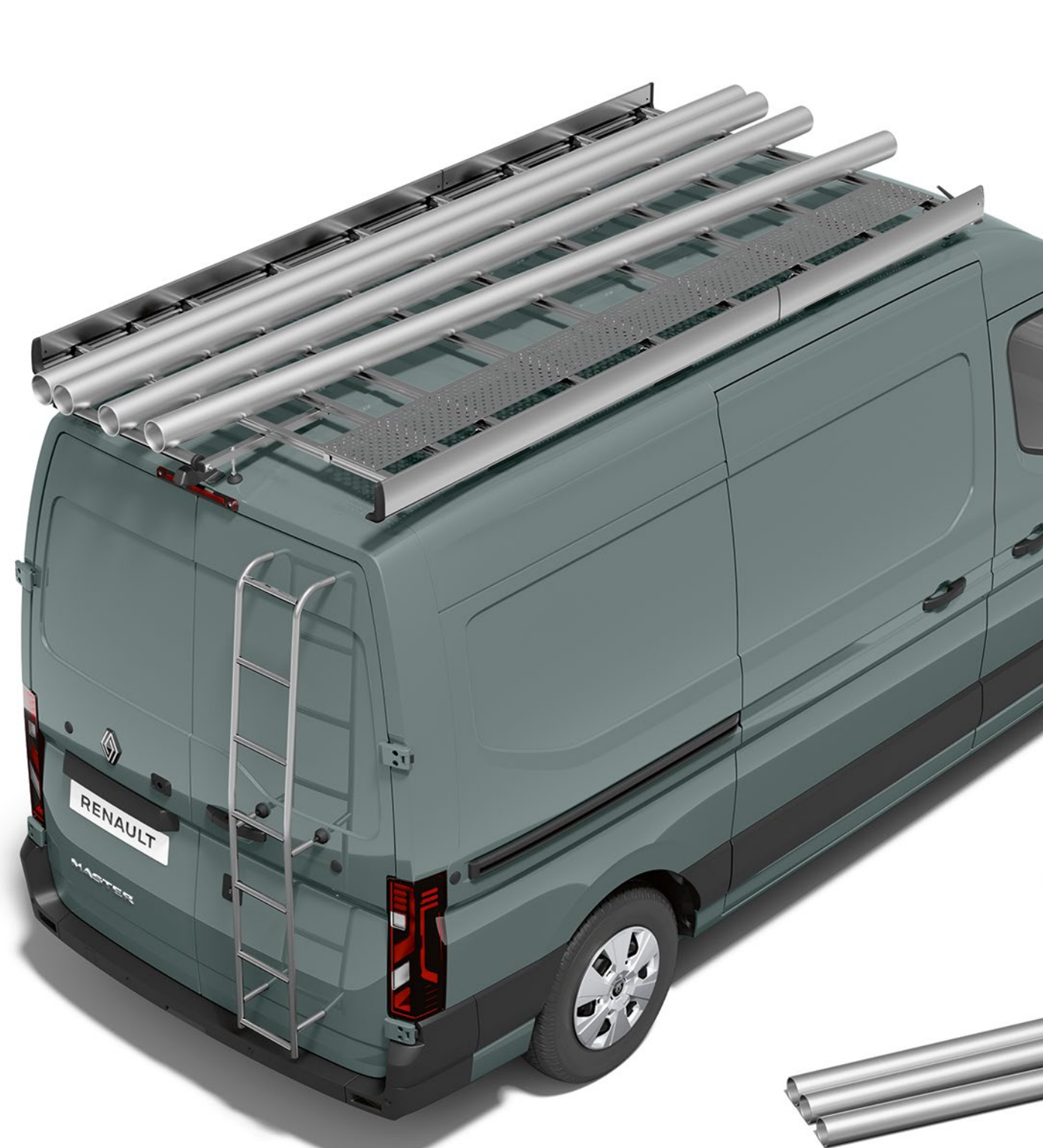
roof rack, walkway and a ladder

Fit up to 5 Renault roof bars (2) to increase your vehicle's loading capacity. You can carry your professional equipment – such as a signage kit and ladders.