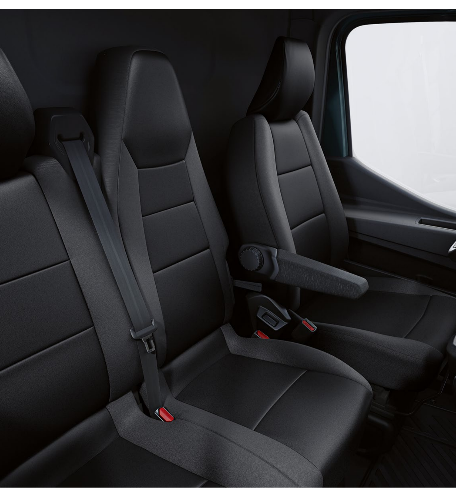
grained coated fabric covers

Seat covers that protect the original upholstery from wear and dirt. Removable smartphone holder that allows you to use your phone fully and safely during your journeys. Finally, the cool box to keep meals and drinks at the right temperature.